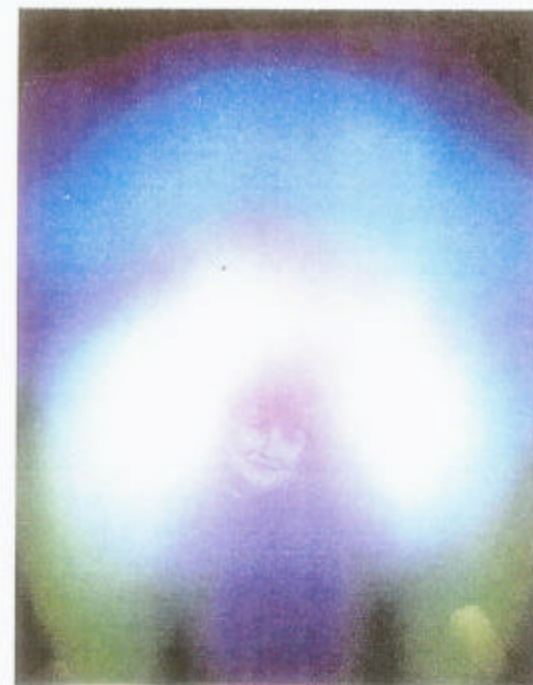
SUBJECT USING ACTIVE CELLULAR PHONE WITH CELLULAR PHONE TAB ATTACHED.

NOTE HOW THE SUBJECT'S ENERGY FIELD HAS BEEN RESTORED.