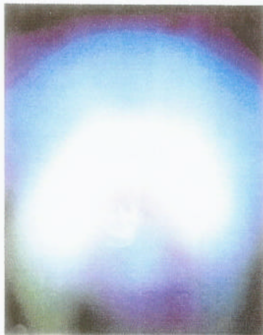
SUBJECT'S NATURAL ENERGY FIELD

AURA PHOTOGRAPHY DEMONSTRATING THE EFFECTS OF RADIATIONS FROM AN ACTIVE CELLULAR PHONE ON A SUBJECT'S ENERGY FIELD, WITH THE CORRESPONDING CORRECTIONS WHEN A CRYSTAL CATALYST CELLULAR PHONE TAB HAS BEEN ATTACHED TO THE ACTIVE CELLULAR PHONE.