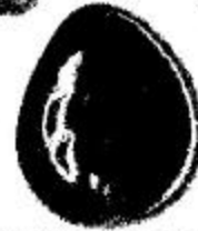
ELECTRONIC-SMOG BUSTER TAB